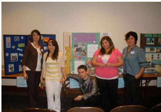
Members of the H.O.T. Club pose for photo before presentation.